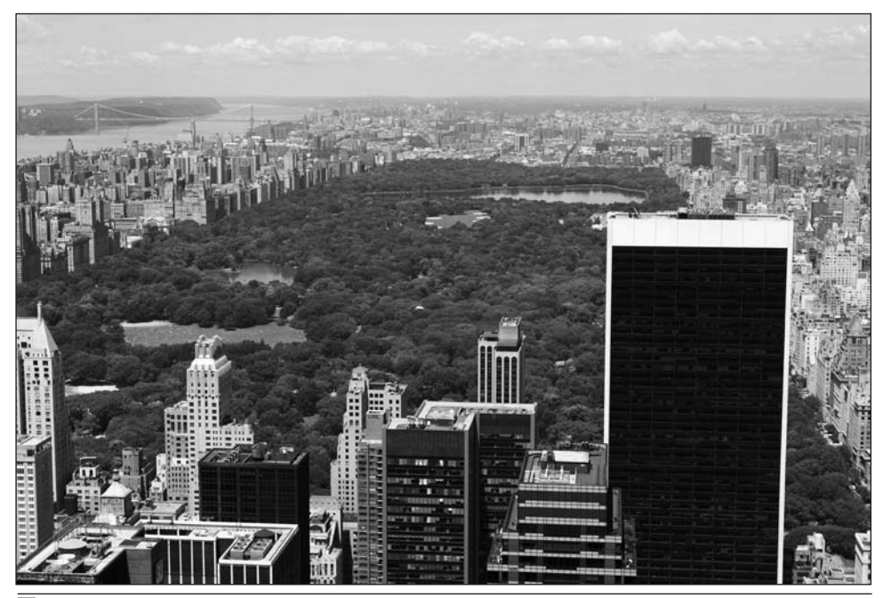
Central Park remains one of the great urban parks in the world. Each year over 25 million people visit the park.

All such developments did not lend themselves immediately to an emphasis on recreation. The primary purpose of the national parks at the outset was to preserve the nation's natural heritage and wildlife. This contrasted sharply with the Canadian approach to wilderness, which saw it as primitive and untamed. Parks, as in Great