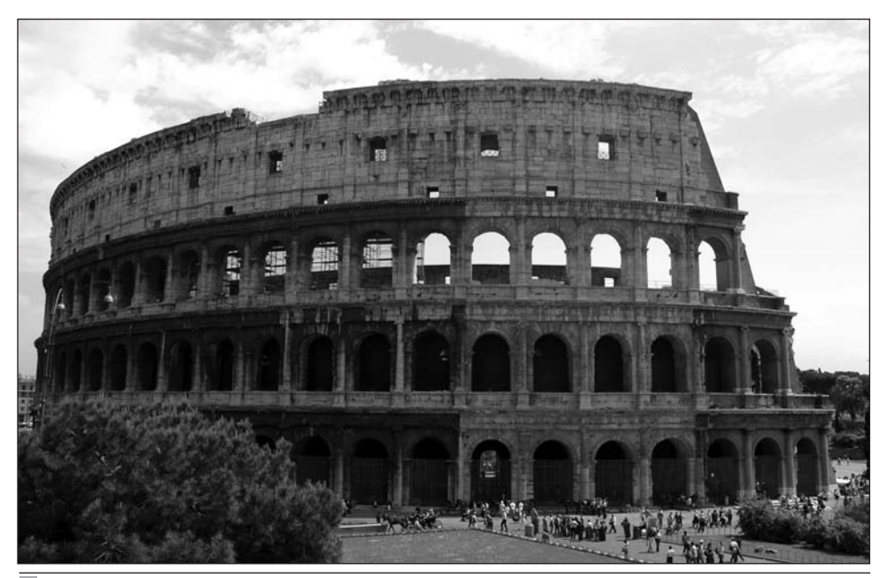
The Roman Colosseum is perhaps the greatest architectural achievement of antiquity. Built over 1925 years ago, the Colosseum is a monument to the achievements of ancient Rome.

interested than the Athenians in varied forms of cultural activity. Although they had many performing companies, usually composed of Greek and southern Italian slaves, the Romans themselves did not actively participate in the theater.